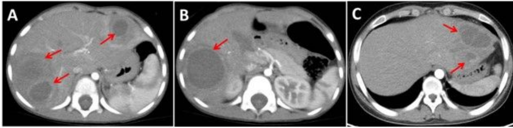
Fig.2 Imaging findings of pediatric PLA cases. Contrast-enhanced CT scan showed lesions were low density, well-defined and mostly similar to the round with edge intensified. A Multiple liver abscesses with bilobar involved. B Single abscess in right lobe. C Multiple liver abscesses in left lobe.

PLA with multiple organs involvement CNS, central nerves system; LN, lymph node;