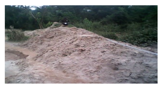
Plate 3: Heaped Laterites at Aboabo