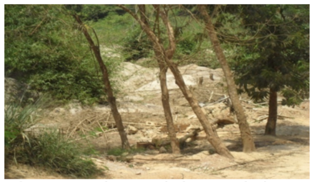
Plate 6: Land Degraded at Manhyia