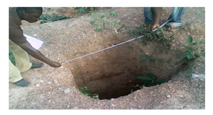
Plate 4: Open-pit created at Esaase