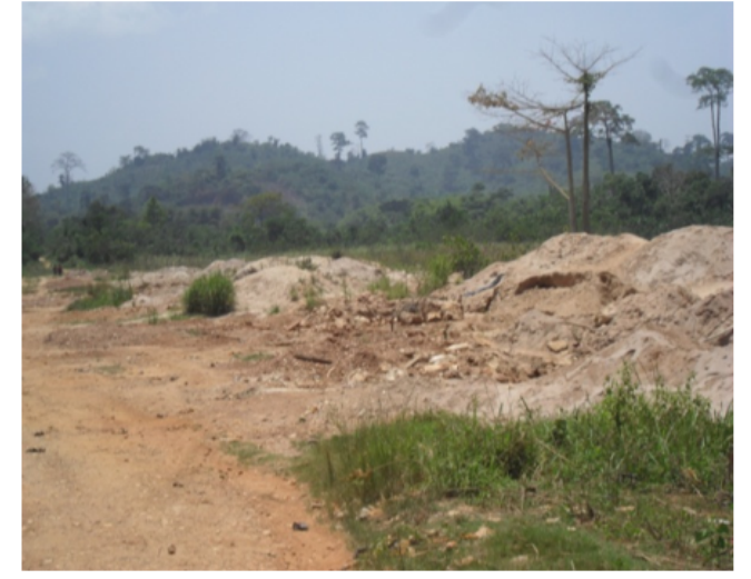
Plate 2: A mining site at Mpatuam