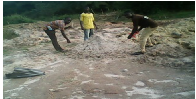
Plate 5: Heaped Laterites at Mpatuam