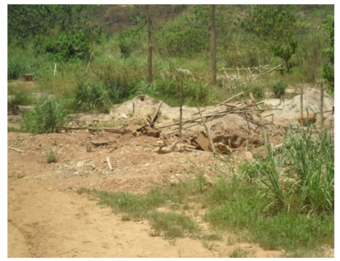
Plate 1: A mining site at Manhyia