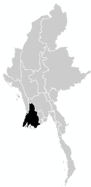
Figure 1. Ayeyarwady Region, Myanmar

A test-negative study design was chosen to estimate malaria risk factors while maintaining key similarities in the control group including participation rates, diagnostic procedures, and information quality and completeness [13]. The townships of Ngaputaw, Patheingyi and Thabaung were selected for the study as they represent some of the highest test positivity rates within Ayeyarwady Region and also share the highest forest cover within the larger Patheingyi district, where natural forest covered over 37% of its land area in 2010 [14]. With forest cover greatly influencing the transmission dynamics of malaria [15], the linkages between forest cover and malaria positivity rates in Ayeyarwady persist amid increasingly focalized malaria cases. As reported malaria cases sharply declined from 2016 to 2017, study sites were selected to prioritize recruitment of positive cases. The highest burden health facilities which had the operational capacity to administer the questionnaire in addition to providing routine services were selected, determined from total reported cases from January 2016 to May 2017, which ranged from 9 to 793 [16]. Additionally, the eight highest burden villages with ICMVs were selected from each township.