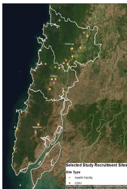
Figure 2. Selected Study Sites, HF and ICMV